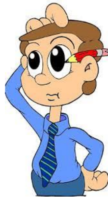
This Is What I Think

We all must stay the course and believe that we WILL see a better tomorrow. To quote Proverbs 23:18, "There is surely a future hope for you and your hope will not be cut off."